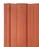
Through Colour Red CT