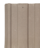
Through Colour Victorian Grey CT