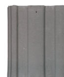
Through Colour Slate Grey CT EC